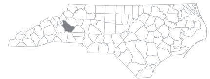
BURKE COUNTY, NC

The Nursing program 1 was established in 1967. In FY 2019-20, WPCC enrolled 69 students in the program. Of these students, 19 graduated with an associate degree in FY 2019-20.