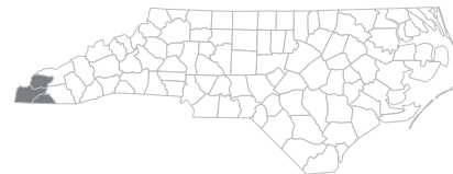
THE TCCC SERVICE AREA, NC

Tri-County Community College (TCCC) creates a significant positive impact on the business community and generates a return on investment to its major stakeholder groups—students, taxpayers, and society. Using a two-pronged approach that involves an economic impact analysis and an investment analysis, this study calculates the benefits received by each of these groups. Results of the analysis reflect fiscal year (FY) 2019-20.