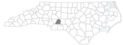
STANLY COUNTY, NC

The Early Childhood Education program 1 was established in 1997. In FY 2019-20, SCC enrolled 692 students in the program. Of these students, 18 graduated with a certificate and 32 graduated with an associate degree in FY 2019-20. The remaining students were enrolled with the intent of returning the next year to work on completing their degree.