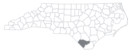
COLUMBUS COUNTY, NC

All results reflect employee, student, and financial data, provided by the college, for fiscal year (FY) 2019-20. Impacts on the Columbus County economy are reported under the economic impact analysis and are measured in terms of added income. The returns on investment to students, taxpayers, and society in North Carolina are reported under the investment analysis.