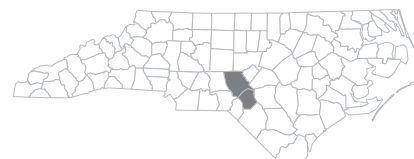
THE SANDHILLS' SERVICE AREA, NC

The Radiography program 1 was established in 1975. In FY 2019-20, SCC enrolled 29 students in the program. Of these students, 13 graduated with an associate degree in FY 2019-20.