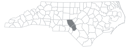
THE SANDHILLS SERVICE AREA, NC

Sandhills Community College (SCC) creates a significant positive impact on the business community and generates a return on investment to its major stakeholder groups—students, taxpayers, and society. Using a two-pronged approach that involves an economic impact analysis and an investment analysis, this study calculates the benefits received by each of these groups. Results of the analysis reflect fiscal year (FY) 2019-20.