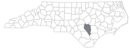
SAMPSON COUNTY, NC

Sampson Community College (SCC) creates a significant positive impact on the business community and generates a return on investment to its major stakeholder groups—students, taxpayers, and society. Using a two-pronged approach that involves an economic impact analysis and an investment analysis, this study calculates the benefits received by each of these groups. Results of the analysis reflect fiscal year (FY) 2019-20.