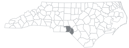
THE RICHMONDCC SERVICE AREA, NC

The Nurse Aid I program 1 was established in 1971. In FY 2019-20, RichmondCC enrolled 171 students in the program. Of these students, nine graduated with a certificate and five graduated with an associate degree in FY 2019-20. Another 22 students graduated from the workforce development program.