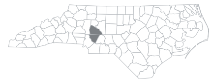
CABARRUS AND ROWAN COUNTIES, NC

The Information Technology – Cyber Security program 1 was only recently established in 2016. In FY 2019-20, RCCC enrolled 188 students in the program. Of these students, 77 graduated with a certificate and 14 graduated with an associate degree in FY 2019-20.