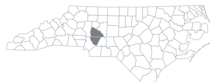
THE RCCC SERVICE AREA, NC

All results reflect employee, student, and financial data, provided by the college, for fiscal year (FY) 2019-20. Impacts on the RCCC Service Area economy are reported under the economic impact analysis and are measured in terms of added income. The returns on investment to students, taxpayers, and society in North Carolina are reported under the investment analysis.