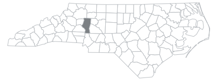
IREDELL COUNTY, NC

The Information Technology program 1 was established in 1973. In FY 2019-20, Mitchell enrolled 131 students in the program. Of these students, 27 graduated with a certificate and seven graduated with an associate degree in FY 2019-20.