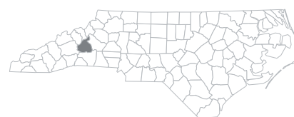
MCDOWELL COUNTY, NC

This study measures the economic impacts created by MTCC on the business community and the benefits the college generates in return for the investments made by its key stakeholder groups—students, taxpayers, and society. The following two analyses are presented: