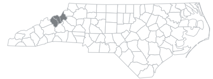
THE MCC SERVICE AREA, NC

The Computer Information Technology program 1 was established in 2002. In FY 2019-20, MCC enrolled 24 students in the program. Of these students, six graduated with an associate degree in FY 2019-20.