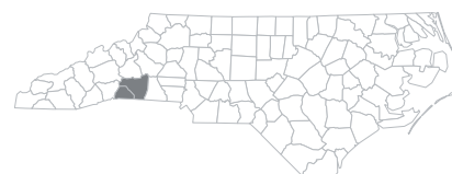
THE ICC SERVICE AREA, NC

The Associate Degree Nursing program 1 was established in 1991. In FY 2019-20, ICC enrolled 41 students in the program. Of these students, 20 graduated with an associate degree in FY 2019-20.