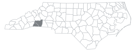
THE ICC SERVICE AREA, NC

Isothermal Community College (ICC) creates a significant positive impact on the business community and generates a return on investment to its major stakeholder groups—students, taxpayers, and society. Using a two-pronged approach that involves an economic impact analysis and an investment analysis, this study calculates the benefits received by each of these groups. Results of the analysis reflect fiscal year (FY) 2019-20.