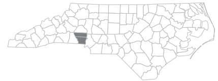
THE GC SERVICE AREA, NC

The Business/Supply Chain program 1 was established in 1964. In FY 2019-20, GC enrolled 532 students in the program. Of these students, 53 graduated with a certificate and 48 graduated with an associate degree in FY 2019-20.