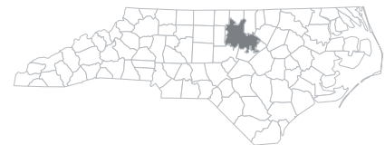
THE DURHAM TECH SERVICE REGION, NC

The Occupational Therapy program 1 was established in 1995. In FY 2019-20, Durham Tech enrolled 54 students in the program. Of these students, 23 graduated with an associate degree in FY 2019-20.