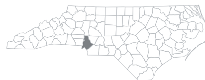
MECKLENBURG COUNTY, NC

All results reflect employee, student, and financial data, provided by the college, for fiscal year (FY) 2019-20. Impacts on the Mecklenburg County economy are reported under the economic impact analysis and are measured in terms of added income. The returns on investment to students, taxpayers, and society in North Carolina are reported under the investment analysis.