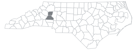
THE CVCC SERVICE AREA, NC

Catawba Valley Community College (CVCC) creates a significant positive impact on the business community and generates a return on investment to its major stakeholder groups—students, taxpayers, and society. Using a two-pronged approach that involves an economic impact analysis and an investment analysis, this study calculates the benefits received by each of these groups. Results of the analysis reflect fiscal year (FY) 2019-20.