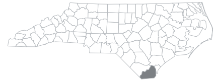
BRUNSWICK COUNTY, NC

Brunswick Community College (BCC) creates a significant positive impact on the business community and generates a return on investment to its major stakeholder groups—students, taxpayers, and society. Using a two-pronged approach that involves an economic impact analysis and an investment analysis, this study calculates the benefits received by each of these groups. Results of the analysis reflect fiscal year (FY) 2019-20.