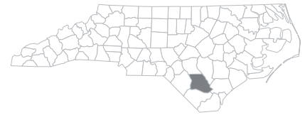
BLADEN COUNTY, NC

The Nursing program 1 was established in 1968. In FY 2019-20, BCC enrolled 290 students in the program. Of these students, 30 graduated with a certificate and 43 graduated with an associate degree in FY 2019-20.